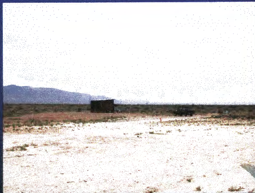
View of area looking Southeast towards thermal decontamination unit