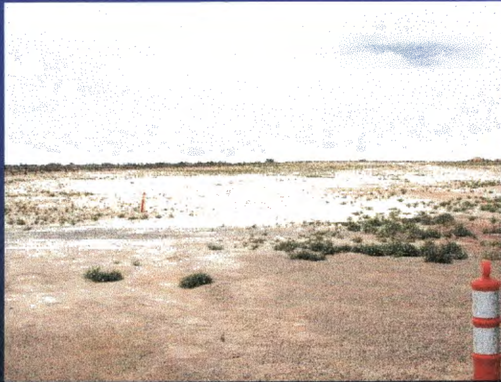
View of area looking Northwest from the thermal decontamination unit