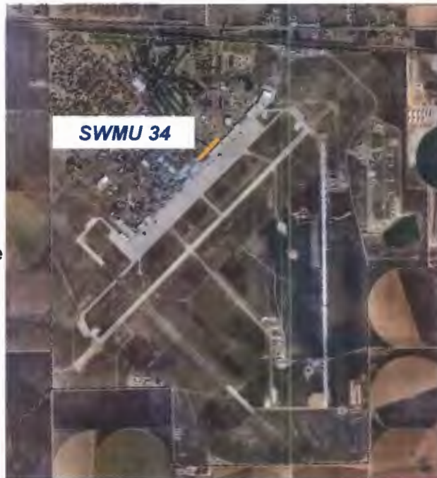
SWMU 34 Site Location At Cannon Air Force Base